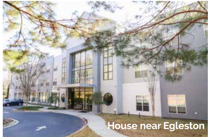
House near Egleston

$8.4 million saved in lodging, transportation and food costs Atlanta Ronald McDonald Houses, a 47% increase over 2022