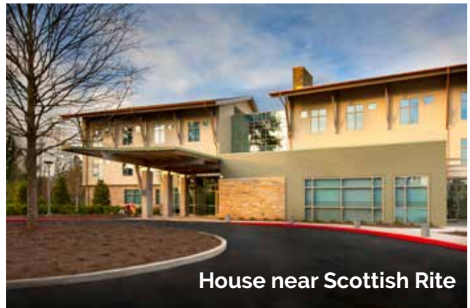
House near Scottish Rite

88% Families cannot afford to make a contribution toward their stay