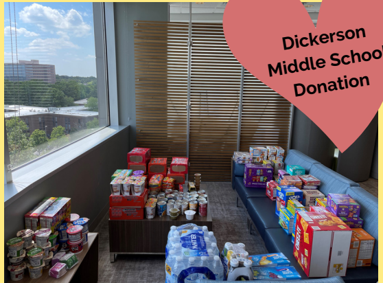
Dickerson Middle School Donation

Recently, one of Dickerson Middle's own was affected by a childhood illness. The family has been using our Family Room and noted that it had been a great place of respite. In response, Dickerson Middle School rallied its supporters and donated a room full of supplies to help a family close to them and many others.