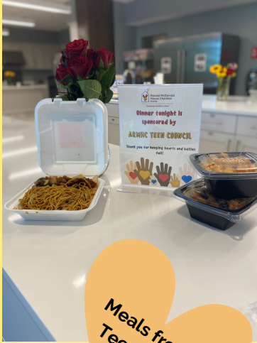
Meals from our Teen Council

Recently, one of Dickerson Middle's own was affected by a childhood illness. The family has been using our Family Room and noted that it had been a great place of respite. In response, Dickerson Middle School rallied its supporters and donated a room full of supplies to help a family close to them and many others.